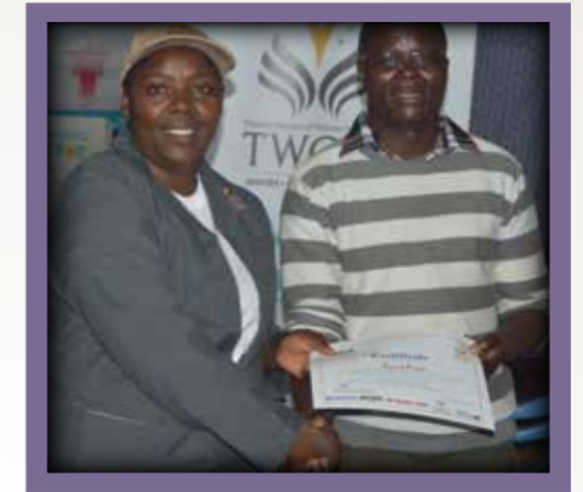
Thank you for making us proud