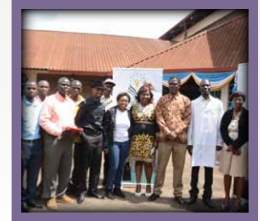
TWOW team with Kibera Member of County Assembly and Partners