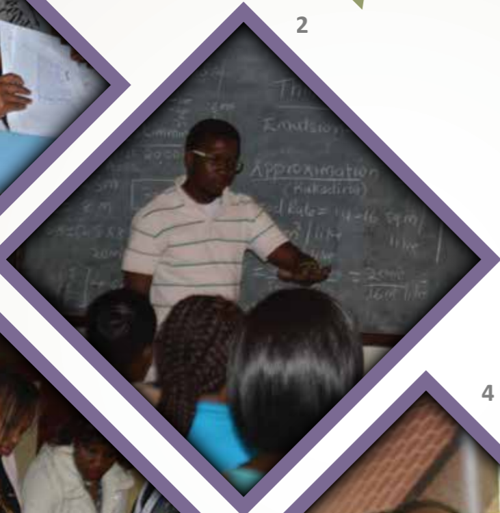
2. Trainer on the job