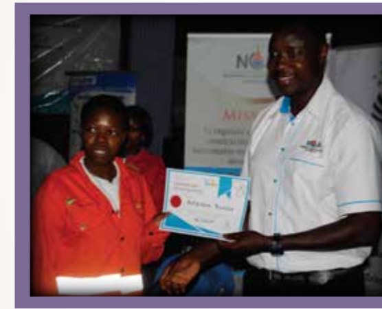
Sponsor representative honors graduate