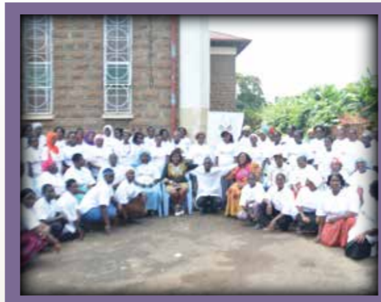
Trainees pausing with TWOW team and partners