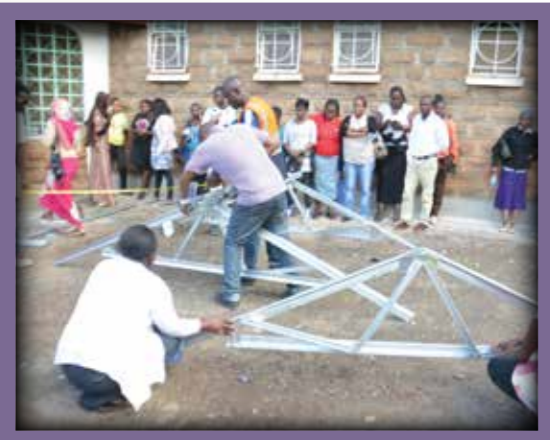
Roofing in progress