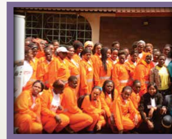
Painting Kibera orange