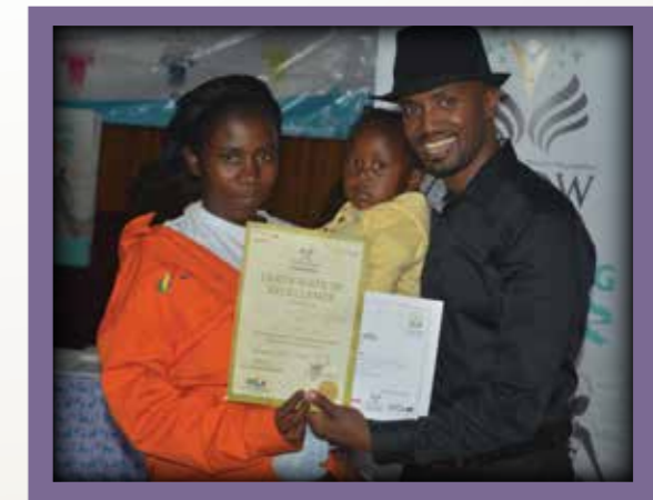
Proud mother, proud child