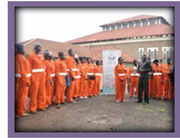
Standing proud after a long day's work