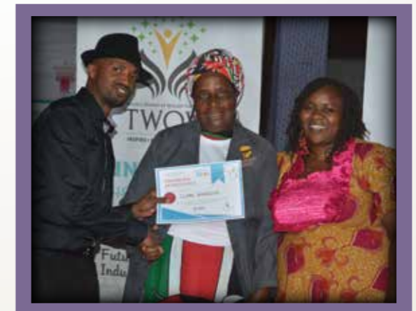
A graduate honored by TWOW team