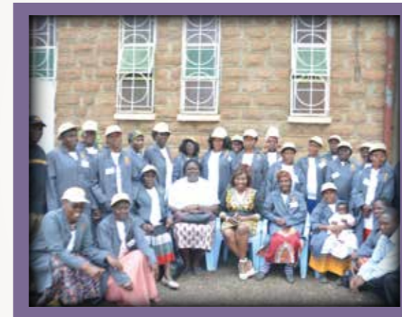
The growing TWOW family with mama TWOW at the center