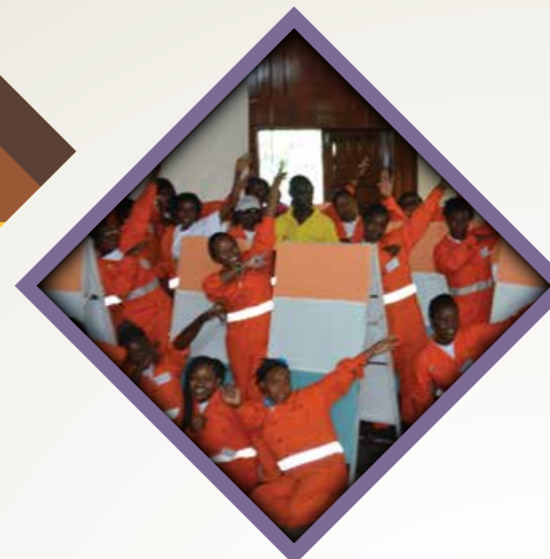
We're growing and we're moving