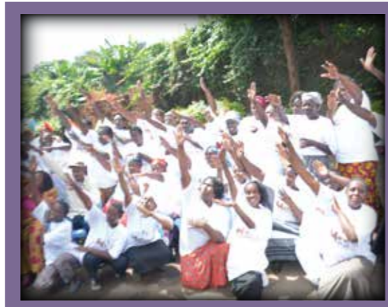
We still have energy at the end of the day!