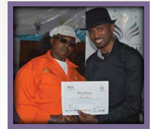
Congratulations are in order