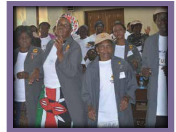
Trainees shake a leg