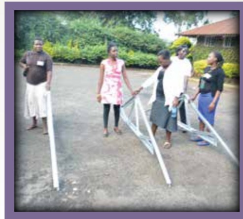
A step in the roofing process