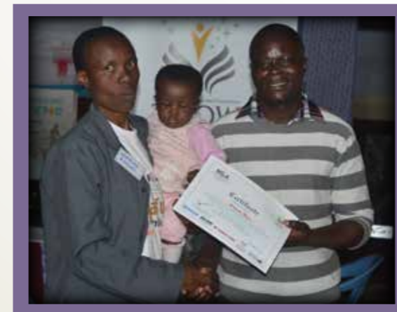
Mother setting a good example